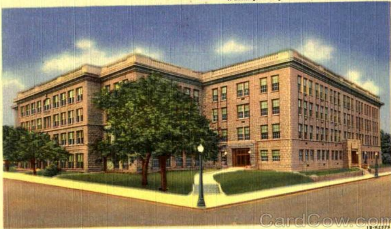
Washington High School, Sioux Falls, S. D.

Thank you to several Classmates that are reporting to the O & B !